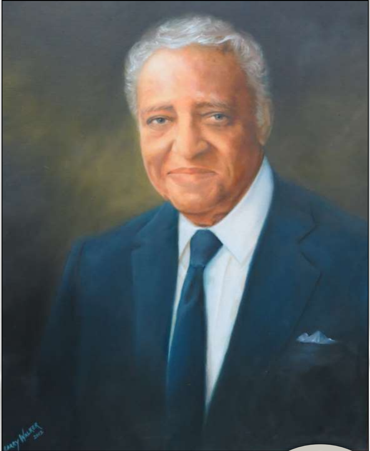
Dr. Benjamin L. Hooks