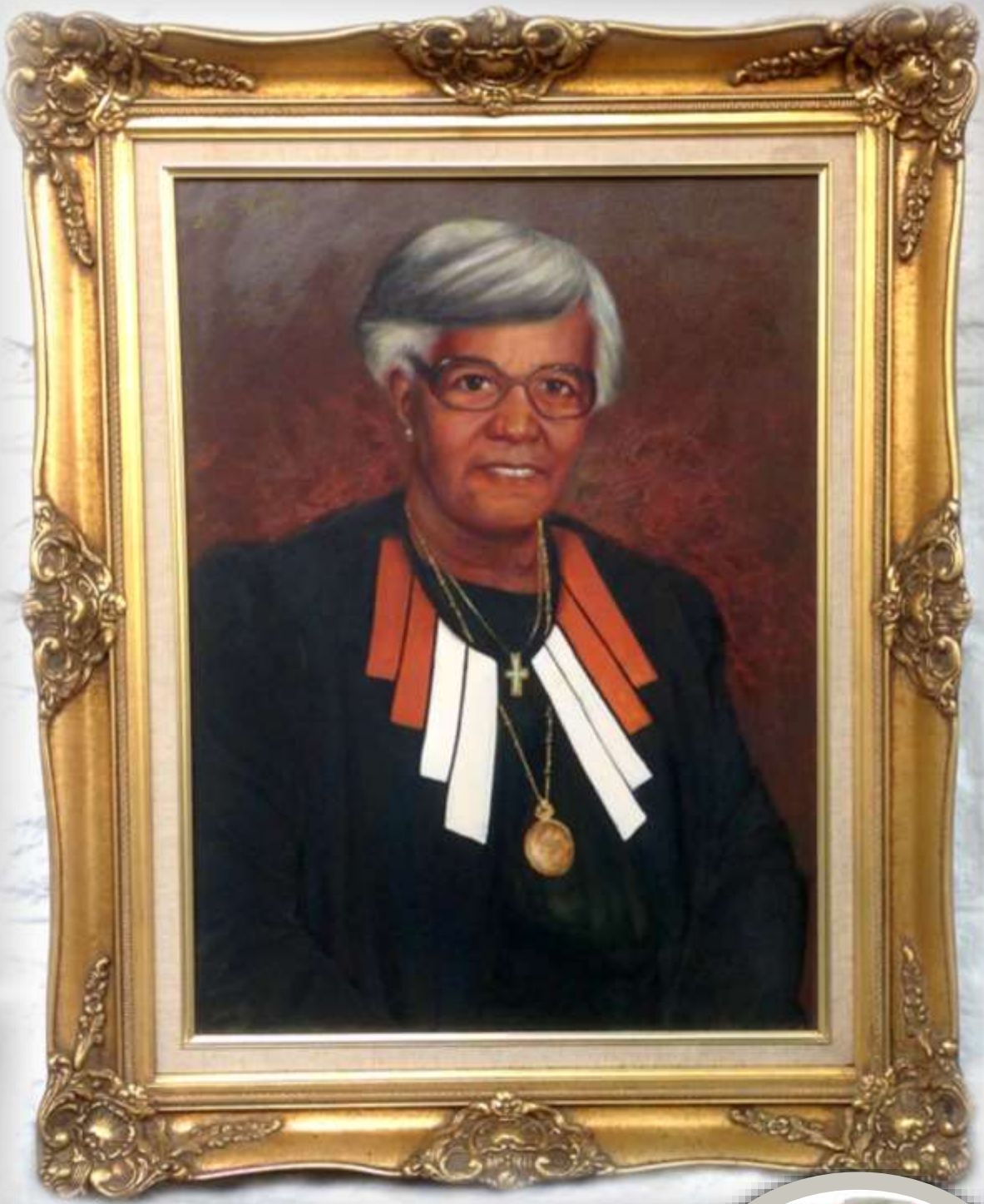
The Late Evangelist Nettie Rogers