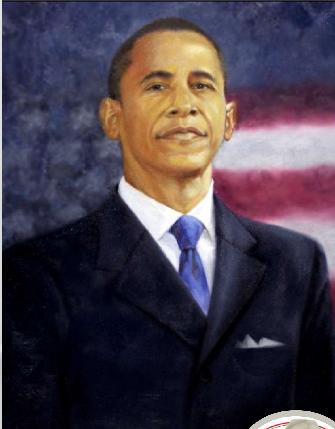
44th President Barack Obama